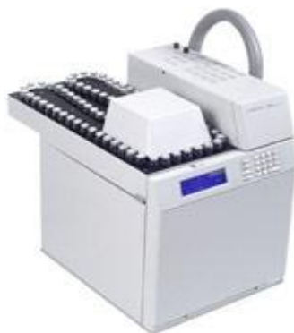
Figure 3. G1888 Headspace Analyzer