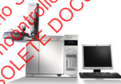
Figure 2. Gas Chromatograph